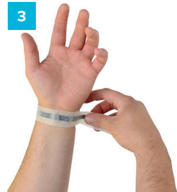
3 Place the tacky side on wrist.