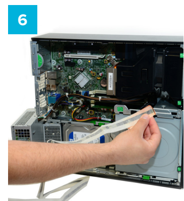
6 Fix the copper foil to your grounding point.

To request a quotation or for more information, please call +44 (0)1473 836200 email info@antistat.co.uk or visit www.antistat.co.uk