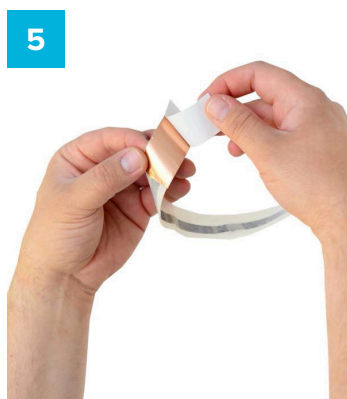
5 Peel back to reveal copper foil layer at the other end.