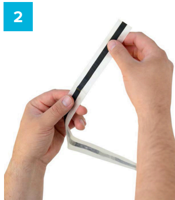
2 Peel back to reveal adhesive layer.