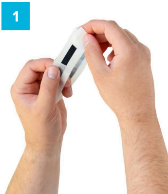
1 Remove wrist strap from external packaging.