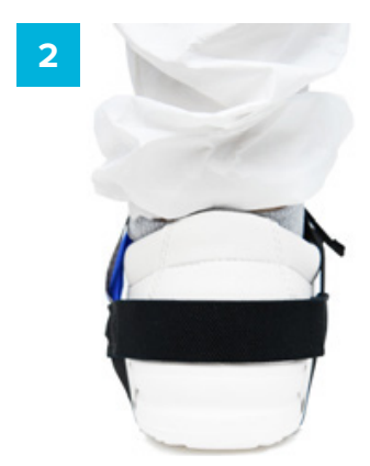
Place the Black Elastic Strip at the back of the shoe.