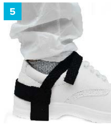
Inspect the Heel grounder for a secure and comfortable fit by gently tugging on the straps.