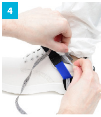
Feed the Grey Conductive Ribbon into the sock or shoe to complete the grounding path.