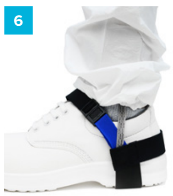
The footwear is now ready to be tested before entering a static sensitive area. Repeat with other shoe.

To request a quotation or for more information, please call +44 (0)1473 836200 email info@antistat.co.uk or visit www.antistat.co.uk