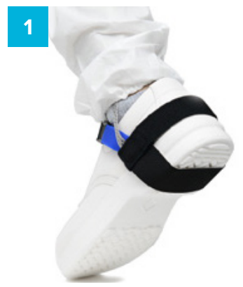
Remove Heel Grounder from its packaging and place the Black Conductive Rubber Strip on the heel grip of the shoe.