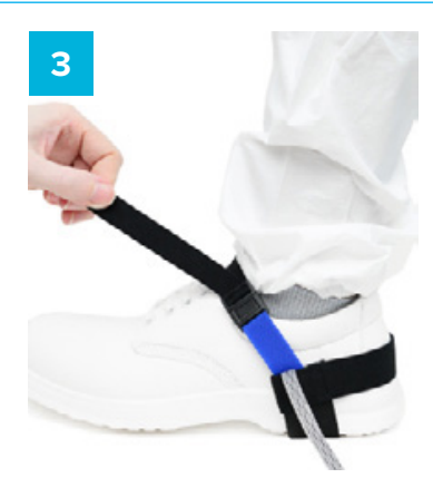
Push the Clip Fastener together to lock in place and pull the tail of the Black Elastic Strap to tighten.