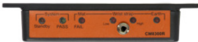
Under Bench Option

Audible alarm on Earth, ground, mat or wrist strap connection fail.