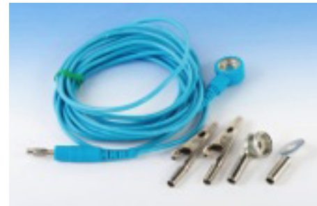
As shown, two 0Ω leads supplied

The In-Line wrist strap, mat and Earth Constant Monitor is designed to continuously monitor whether the wrist strap, bench mat or the Earth is disconnected whilst simultaneously checking the Earth to ground system is working correctly.